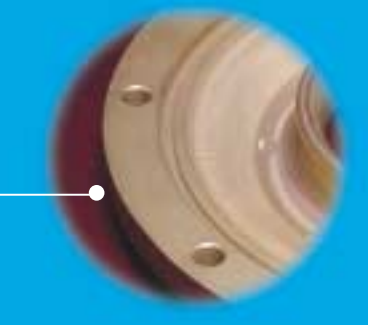
<u>fine surface finish</u>

engineered components supplied turnkey 5-axis, multi-pallet, 0.0002 tolerances